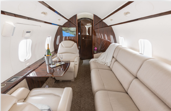
Cabin Seating For Up to 9