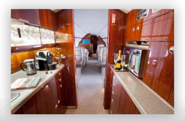
Cabin Seating For Up to 13-14